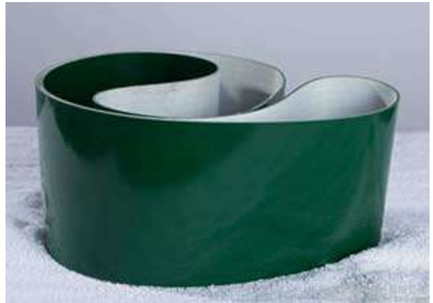
PU conveyor belt

Polyester conveyor belt price is relatively high, but in the long run, polyester conveyor belt will be more economic.