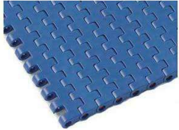
Plastic interlocking belts

Plastic interlocking belt is a new type of conveyor belt, which has many advantages over the traditional conveyor belt: high strength, acid resistance, alkali resistance and salt water, wide temperature range, good anti viscosity, can be added with cleats, large lifting angle, easy cleaning, simple maintenance, and can be used for transportation in various environments.