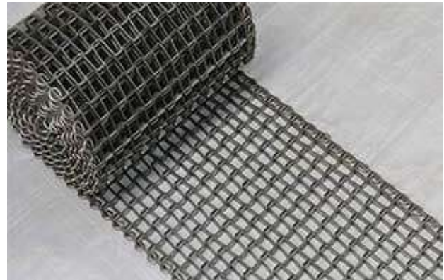
Stainless steel conveyor belt

According to different weaving methods, metal conveyor belt can be divided into different types, such as diamond mesh belt, trapezoid metal mesh belt, ball mesh belt, u-chain mesh belt. The material of metal conveyor belt can also be used according to different requirements: stainless steel wire, carbon steel wire, polyester wire and galvanized wire, etc.