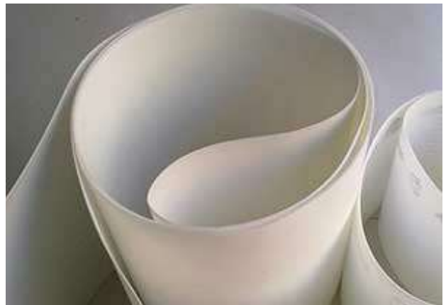
PE conveyor belt

PE conveyor belt conforms to the American FDA health standards, can be in direct contact with food, medicine, etc., and is a durable conveyor product.