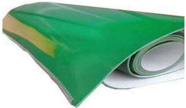
PVC conveyor belt

PVC conveyor belt features good elasticity, not easy to deform and wear-resistant. It is mainly used in food, tobacco, logistics, packaging and other industries. At the same time, it is suitable for underground transportation of coal mines, as well as material transportation of metallurgy and chemical industries.